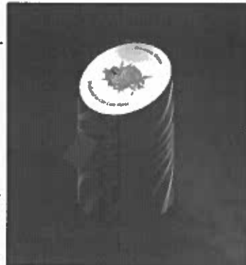
Design by Noah Burge

- Sign signifies a tree stump - Once the person we are remembering is no longer with us, they are very much a part of our roots. - "Flange" surface of the sign will be glass, the body of the "stump" will be hollow - A light will be placed at the base and shine upward, illuminating the written surface - The "stump" will have two sections one of brass and the other, either silver or marble. - The interior of the stump will be either silver or marble.