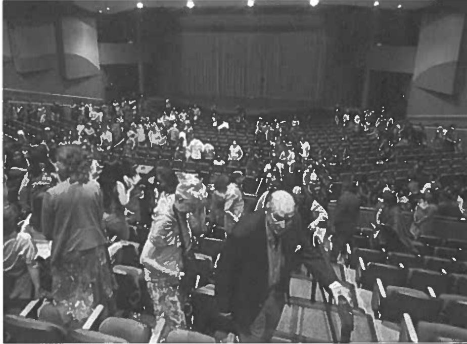
Exhibit 7b. - India Nite Crowd