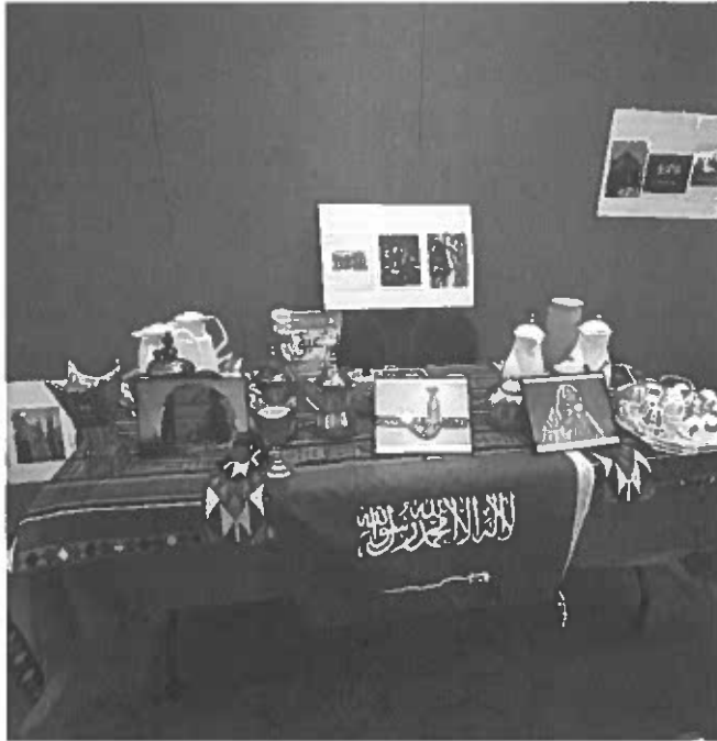
Exhibit 2a. - Saudi National Day Celebration