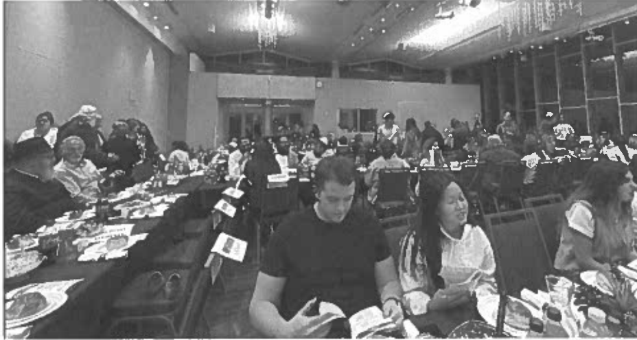
Exhibit 6. - AISES Pow Wow Dance